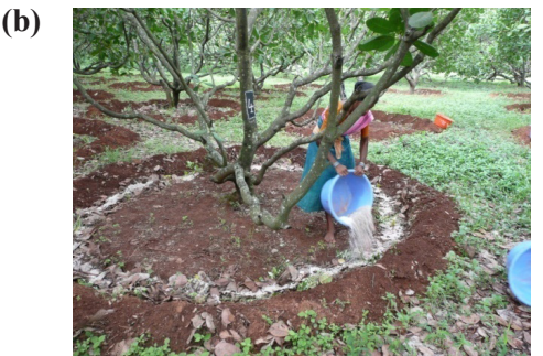
Fig. 2. Method of application of fertilizers to cashew plants: (a) ring formation, (b) application of fertilizer.